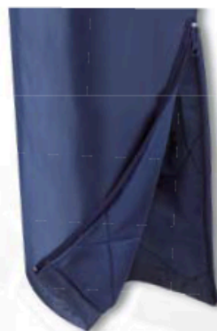
Quilted interior lining detail